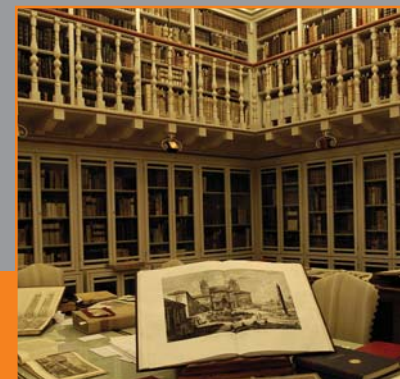
E. COLOMBO ROOM

Collections in the reading rooms are located on open shelves, directly accessible to users. Online catalogues and the Internet are available, as well as multiple electronic resources, including: CD-ROMs, DVDs, databases, online information services and electronic periodicals. Library personnel are available for information and consultation assistance.